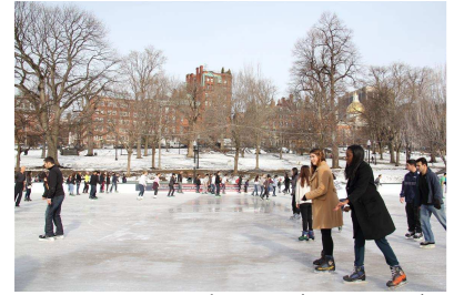
Skating at the Frog Pond