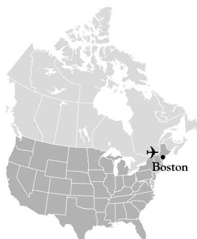
OISE in the USA

OISE offers both homestay and residential courses in a choice of locations throughout the UK and the USA